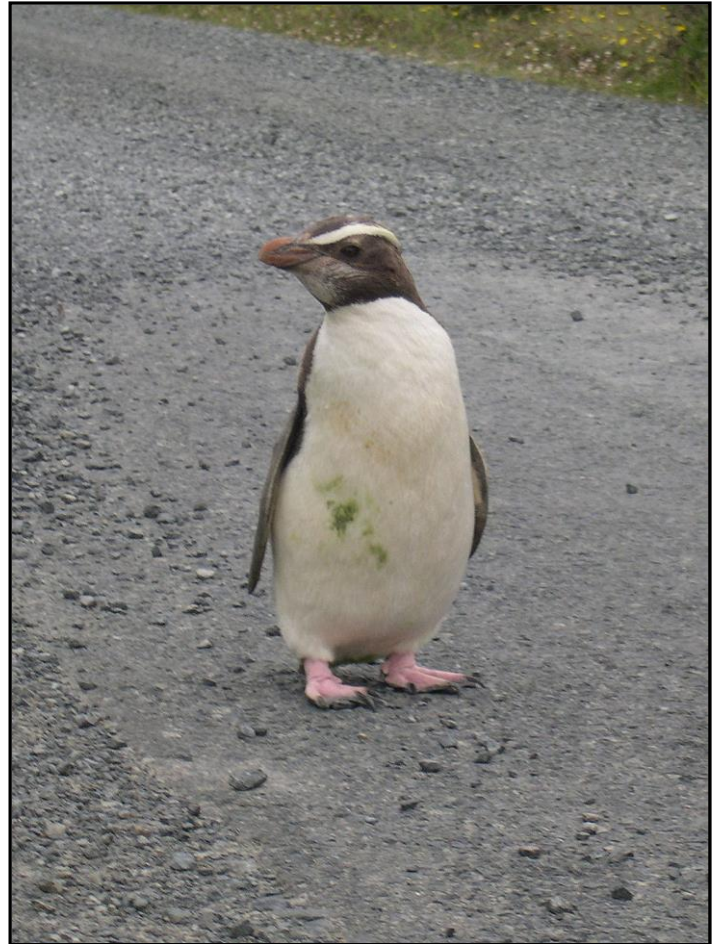
Fiordland Crested strolling along the road in Aramoana

DON'T FORGET TO CHECK OUT OUR WEBSITE, set up for us last year. It has lots of background information, newsletters going back 10 years and updates and pictures of our ongoing projects