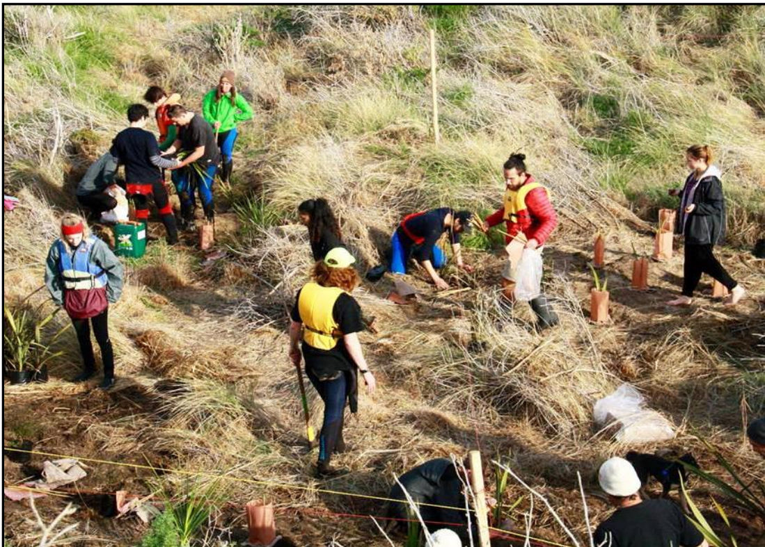
Visitors clearing and planting on Ohinepouwera