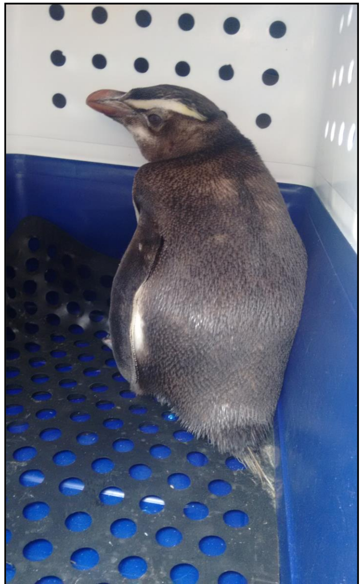
Tawaki on his way to hospital

The young male had come ashore to moult, which can take about 3 weeks. While the new feathers are growing in, they are not waterproof so he would have been unable to go back into the sea to feed and would have been at risk of starvation. These penguins can lose half their body weight during the moult. He would also have been very vulnerable to disturbance in general and dog/stoat attacks in particular.