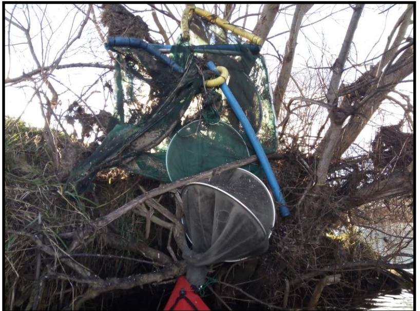
Abandoned nets after a flood

River-Estuary Care: Waikouaiti-Karitane has been working to maintain and enhance whitebait habitat through education and habitat restoration since 1999.